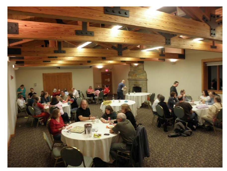
Friends and fun in the activity room