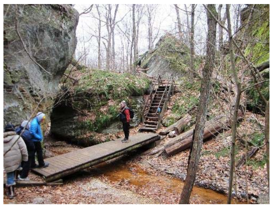
Exploring the scenic woods of Punderson State Park