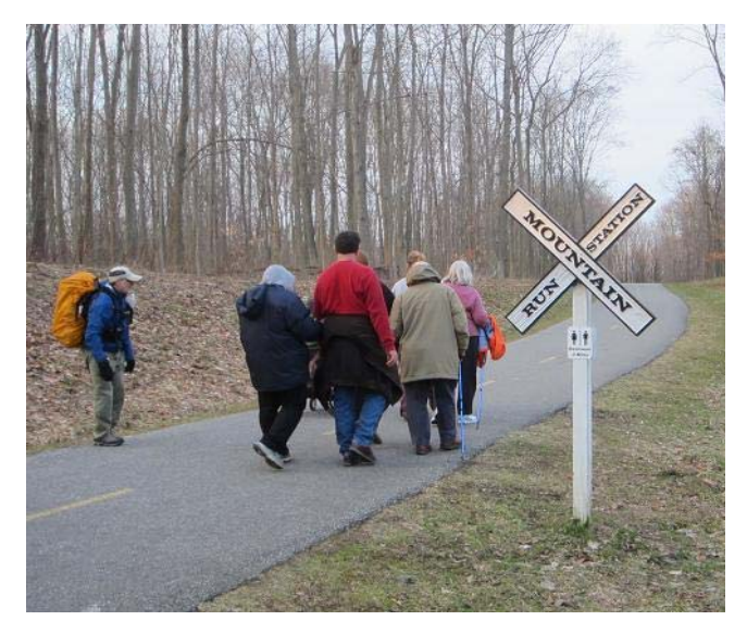
Retreat guests enjoying a winter hike