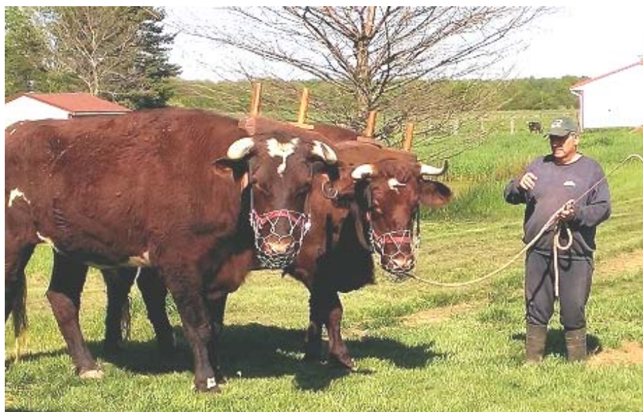
Harnessing up over two tons of ox power