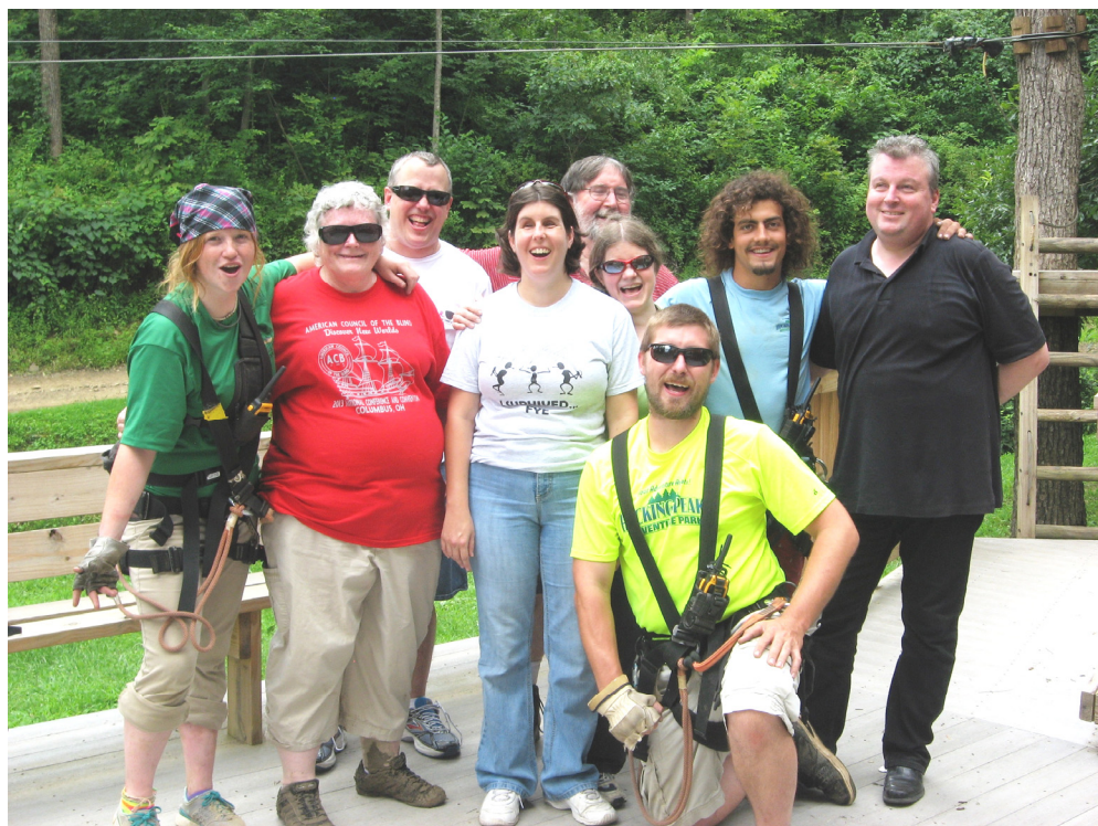
The zipline group with guides in Hocking Hills