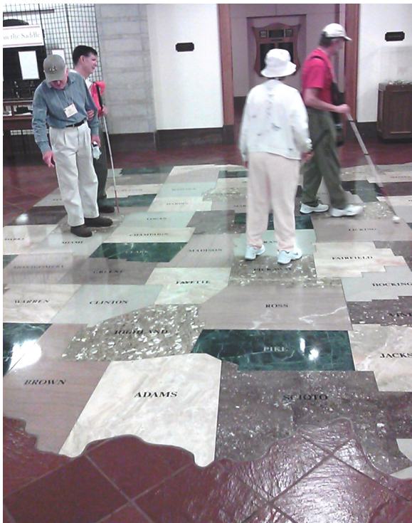
Convention attendees from Ohio locate their respective counties outlined on the Statehouse floor.