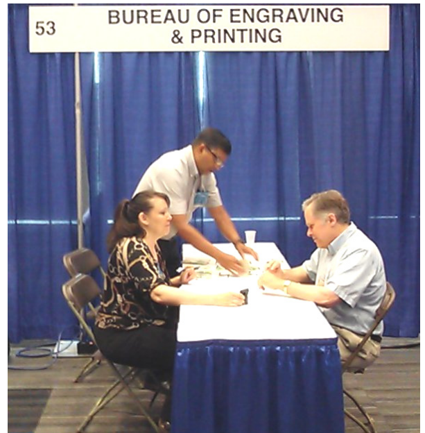
U.S. Department of Treasury Accessible Currency Testing with convention attendee