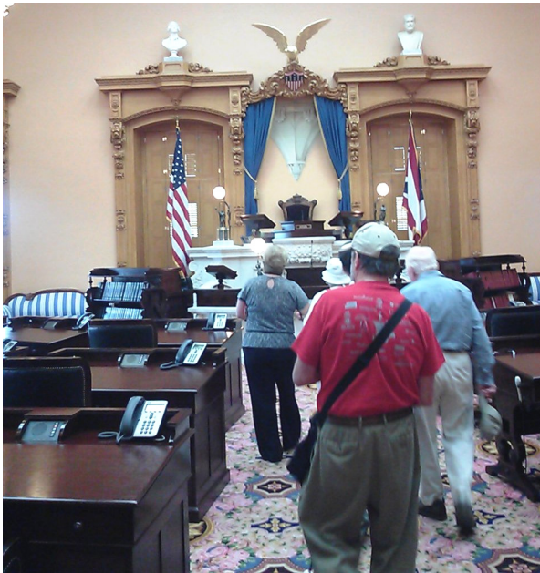
Convention attendees storm the Ohio Senate Gallery floor and explore its ornate fixtures