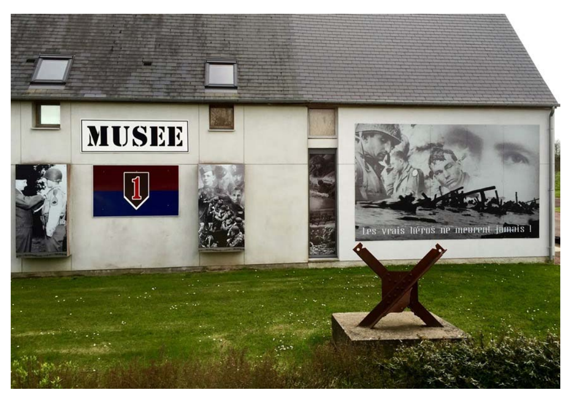
A D-Day museum at Normandy. The mural on the side of the building reads, "The true heroes will never be forgotten."

My first trip to France was an unforgettable experience; visiting sites, hearing sounds, and learning about cultures of northern France are memories I'll keep with me for a lifetime. My French came back to me as I used it on the ship, in shops, and on the street. The meals I enjoyed were out of this world. If only I could cook such flavorful dishes as the chef onboard!