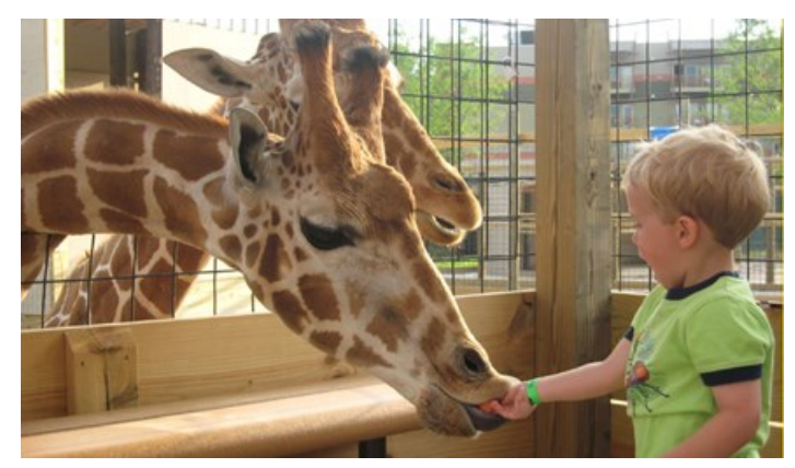
Hand feeding the giraffes is one of many exciting activities at the resort.

The site committee is proud to announce that the 2016 ACBO Annual Conference & Convention will be held at the beautiful Kalahari Resort in Sandusky, Ohio. Bring the whole