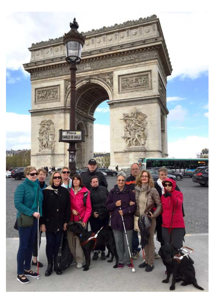
The travel group in front of the Arc de Triomphe in Paris

Prior to departing, we had to organize paperwork for ourselves and our guide dogs. Obtaining passports was a speedy process; filling out the forms for the dogs' access took more time, how-